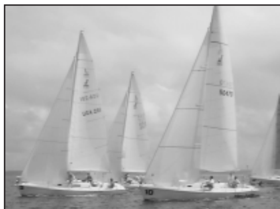
Shortly after the first start on Friday. L to R: FLAME, WET LEOPARD, HEY JUDE, and HOSS.

on the food, with the ribs and cookies on Friday night getting favorable reviews. There was also a great deal of positive feedback about Saturday's meal, even though not everyone saw the Key Lime pie.