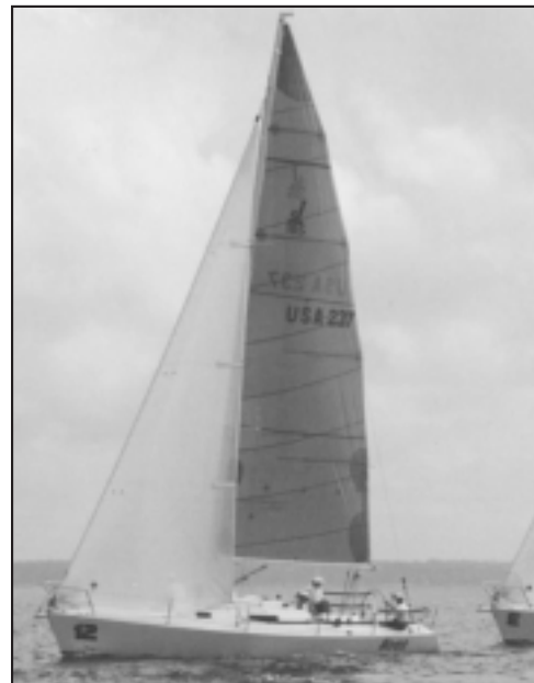
HOSS approaches the first windward mark.

and FLAME went right and most of the boats in pursuit went left. Right turned out to be the better choice, with more pressure under the Long Island Sound shore. Finding the breeze was a challenge and staying on the good