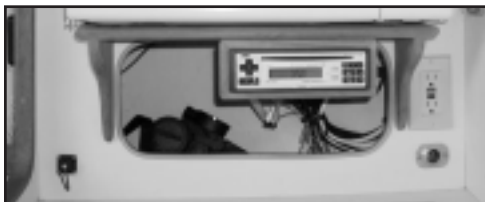
AM/FM/CD stereo & 120V AC duplex outlet at nav station

Nothing sets the mood for a pleasure sail or relaxing evening in the cockpit like some good tunes. On LEGACY, we installed a Clarion M5275 AM/FM Stereo CD player at the nav station and an M101RC remote control unit in the face of the port cockpit