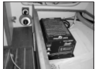
Freedom 10 inverter/charger under port settee

I'd like to give credit to the craftsman at Andersen Boatworks in Deltaville, VA who took my sketchy ideas and created elegant solutions. Now, if you don't mind, I'll leave the driving to the autopilot while I change the CD and mix up another batch of Margaritas!