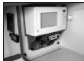
Microwave, stereo, & Link 1000 (under DC switch panel)

The microwave we installed is a compact 600W unit mounted in a cutout over the nav station. Because the door to the head is offset to starboard on a Euro interior, there is significantly more space behind the panel on the port side. The front of the unit is supported by a teak bracket that also supports the stereo, while the back is secured to the hull with a small custom stainless bracket. The microwave is wired directly into the boat's shore power system on its own breaker. (Any wires for instrument sensors routed near the microwave should be shielded. The first time we heated hot chocolate while sailing, my apparent wind instrument indicated we were experiencing a 75-knot microburst!) When selecting a microwave look for compact dimensions, a positive latch on the door, and a carousel that won't slide out when heeled.