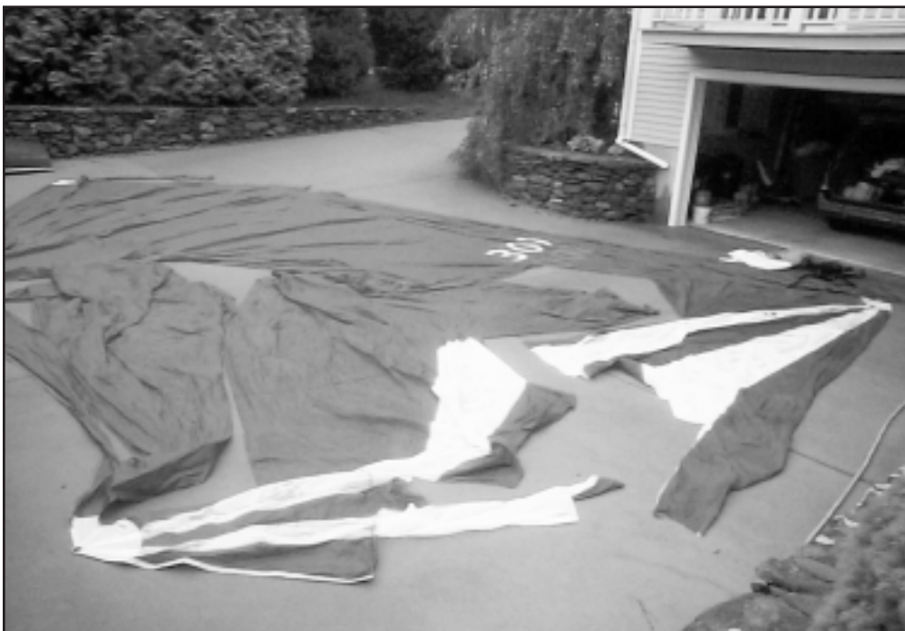
Nelson Weiderman's "babied" spinnaker, obviously at the end of its "ultimate" life.

Sails age and that is a fact of life. New sails will always be faster than old sails, but with proper care, you can make sure that you can get maximum performance life from your inventory.