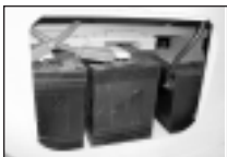
Two 6V batteries connected in series to left of starting battery