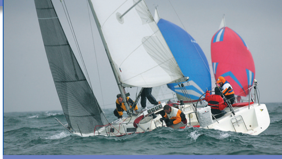
Friday's racing in Toronto provided big waves and plenty of breeze.