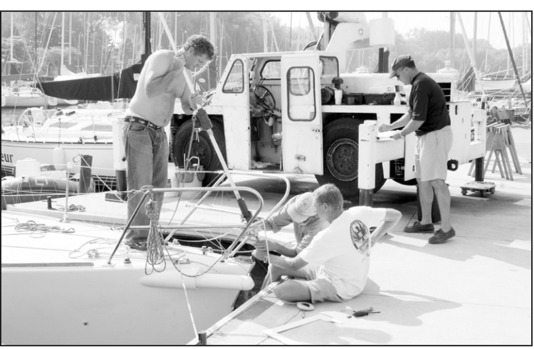
Having the right headstay length is not just critical to speed- it's the law

www.j105.org/diagram/forestay.gif www.harken.com/furling/j105-furlinstall.php