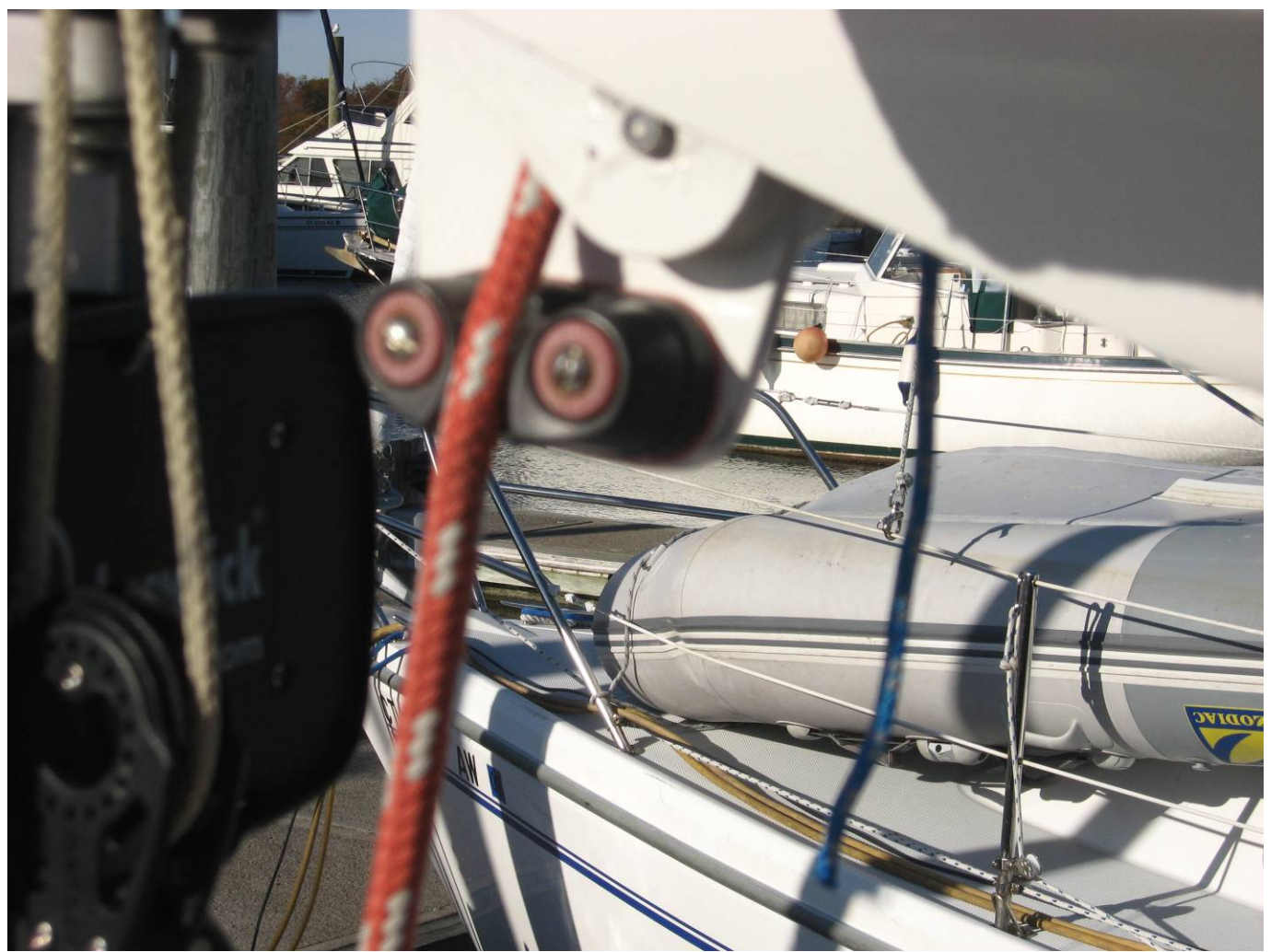
but nothing for locking off the reef line for the 2<sup>nd</sup> reef. Fortunately we did not need to use the stbd winch for the duration of the time the 2<sup>nd</sup> reef was in. The reef line was led the same way as for the first reef, around the hand rail.

Again if I was going to do a lot of this kind of sailing I would install a cam cleat on the opposite side, in this case the starboard side, of the web opposite its mate on the port side. You would use the same size cleat and longer bolts.