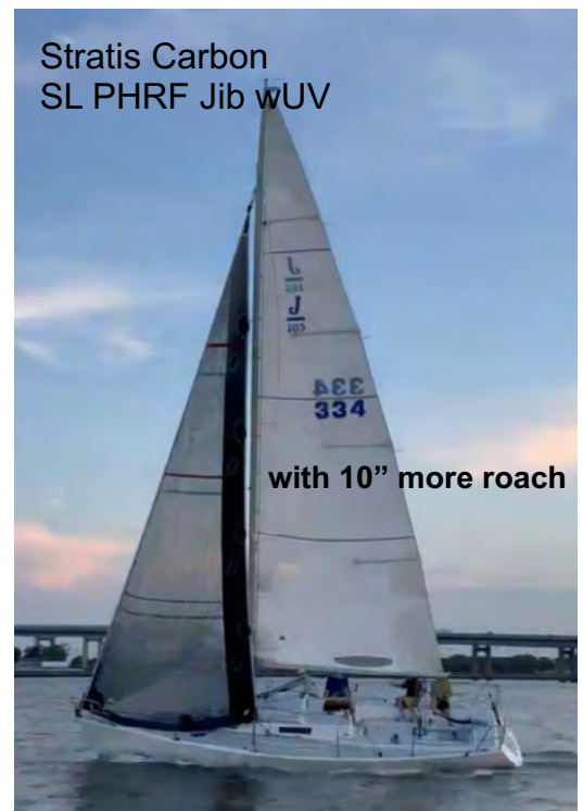
Stratis Carbon SL PHRF Jib WUV